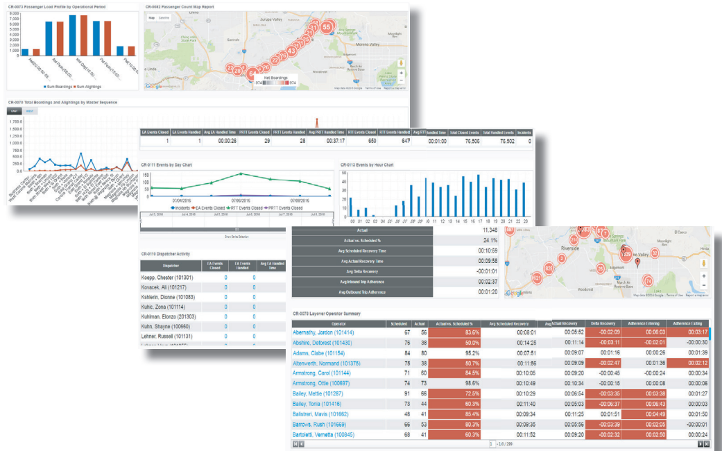
CleverReports™ allows you to view your data in a multitude of dashboards

Reports and supporting data can be printed or exported to many applications including Microsoft Word®, Microsoft Excel® and Adobe PDF®. The built-in email function allows reports to be sent manually or automatically to individuals or groups.